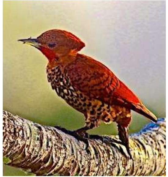
Cinnamon Woodpecker

In addition, we will spend some time searching for two of the real specialty birds of this area: the endemic Yellow-green Tyrannulet and the magnificent Rosy Thrush-Tanager, both of which can be found in this park.