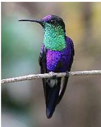
Crowned Woodnymph © Fred Engelmann