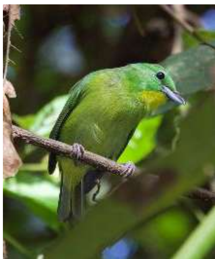
Green Shrike-Vireo