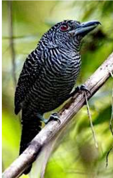
Fasciated Antshrike