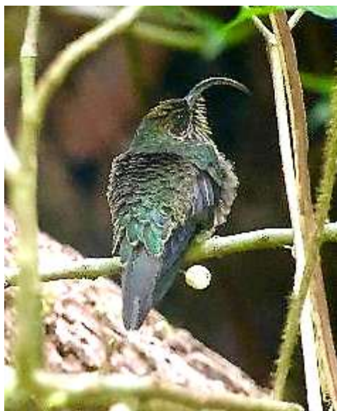
White-tipped Sicklebill

Unfortunately, this huge gated community is slowly being developed and eventually may have as many as 1,000 homes. The developer has built a castle-like home high in one of the undeveloped areas and we may get to see it if there is no fog cover when we drive past it. On our first of two visits, we stop about two kilometers shy of the entrance gate, where we have had great success with rare species like White-tipped Sicklebill, Snowcap, and Stripe-throated Hermit. While watching the Lobster-claw or Heliconia rostrata inflorescences for those three hummingbirds, we will encounter other species such as flycatchers, tanagers, antbirds and woodcreepers.