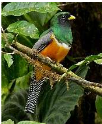
Collared Trogon