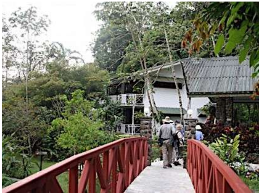
Arriving at Canopy Lodge in El Valle de Antón © Barbara Skelly