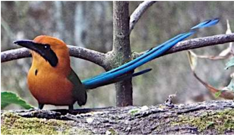
Rufous Motmot