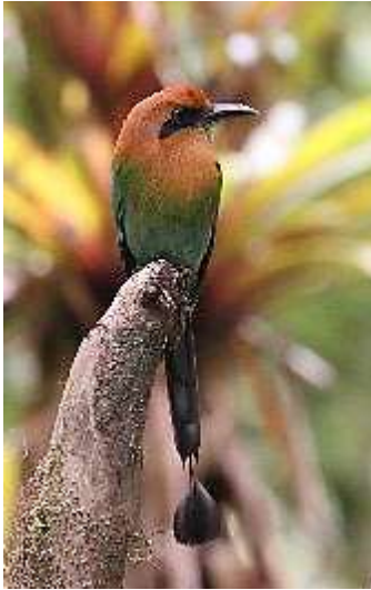
Broad-billed Motmot