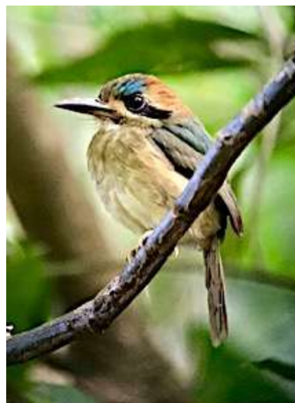
Tody Motmot

After passing the gate, strategic stops at a number of locations will expose us to several impressive stretches of forest. Birds are typically plentiful, but we will focus our efforts on finding more challenging species like Tody Motmot, Collared Trogon, Brown-billed Scythebill, Rufous-browed Tyrannulet, Dull-mantled Antbird, Ochraceous and Rufous-and-white wrens, and the special local subspecies of Common Chlorospingus. The greatest potential prize of this location is the stunning Black-crowned Antpitta. Though secretive and sometimes difficult to see, we have a chance of finding one of these spectacular ground dwellers. A favorite stop on this day is the Santiago Aposto Forest, an incredible patch of climax forest area with gorgeous, tall trees covered with epiphytes. Walking on the paved trail in this lush rainforest is almost magical. On a recent tour, upon our return to the building with bathrooms and a porch, four species interrupted our leader's mini lecture: Ochraceous Wren, Collared Trogon, Chestnut-backed Antbird, and Chestnut-capped Brushfinch.