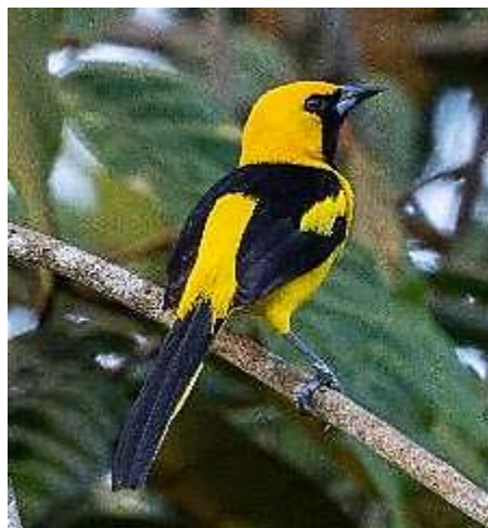
Yellow-tailed Oriole