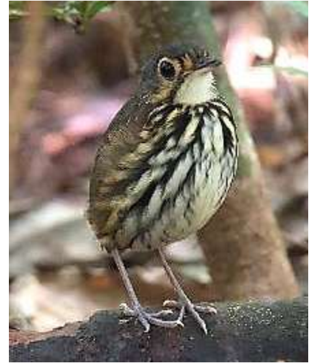
Streak-chested Antpitta © Jeri Langham

Some of the other birds we may encounter in the Pipeline Road area are Black Hawk-Eagle, Blue-headed and Mealy parrots, Slaty-tailed and Black-throated trogons, Rufous Motmot, Great Jacamar, Cinnamon Woodpecker, Scaly-throated Leaf-tosser, Fasciated and Black-crowned antshrikes, Spot-crowned Antvireo, Streak-chested Antpitta (secretive), Brownish Twistwing, and Chestnut-headed Oropendola.