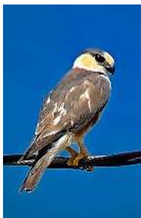
Pearl Kite © Danilo Rodríguez

January 13, Day 10: Juan Hombrón; Santa Clara Beachfront Home. We will depart around 5:00 a.m. to head for the dry Pacific lowlands. Once we reach the Pan-American Highway, we will drive west toward Costa Rica until we reach the unpaved side road to the extensive rice fields at Juan Hombrón. Before reaching the rice fields, we will bird along the tree-lined and shrub-lined, unpaved road for Savanna Hawk, Aplomado Falcon, Pearl Kite, Crested Caracara, Crested Bobwhite, Ferruginous Pygmy-Owl, Brown-throated Parakeet, Sapphire-throated Hummingbird, Veraguan Mango, Orange-chinned Parakeet, Social Flycatcher, Yellow-bellied Elaenia, Barred Antshrike, Mouse-colored Tyrannulet, Lance-tailed Manakin, Pale-eyed Pygmy-Tyrant and Rufous-browed Peppershrike. The extensive rice fields are great for herons, tiger-herons, bitterns, egrets, ibises, Lesser Yellow-headed Vulture, Yellow-headed Caracara, and many raptors following heavy equipment harvesting the fields. A few Swainson's Hawks stop here instead of going all the way down to Argentina for the winter months. The beachfront can be good for shorebirds and a few years ago produced the only American Oystercatcher for this tour. Small ponds might have ducks and Southern Lapwings.