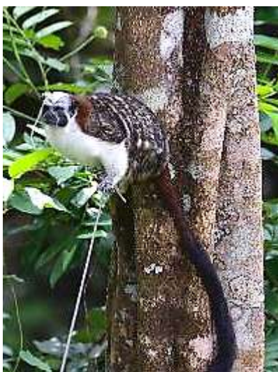
Geoffroy's Tamarin