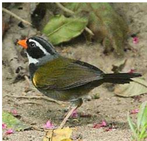
Orange-billed Sparrow

After lunch at 11:30 a.m. we will depart this wonderful setting at 12:30 p.m. and drive back to Panama City via the Pan-American Highway. Our early departure can save more than an hour stuck in traffic returning to Panama City in the late afternoon.