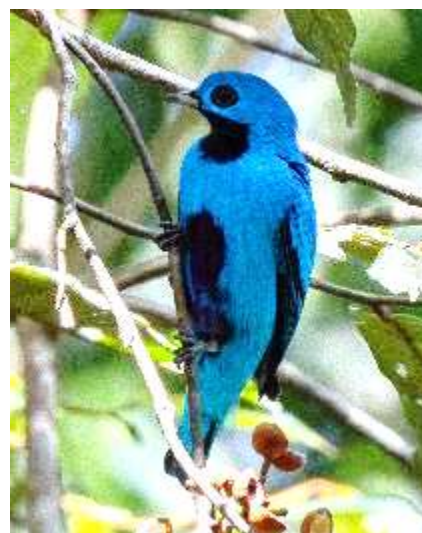
Blue Cotinga © Sam Naifeh