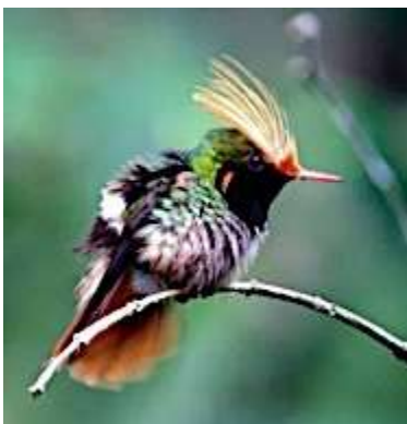
Rufous-crested Coquette