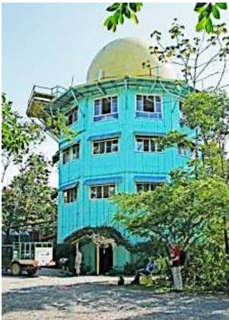
Canopy Tower

Among the pleasures of a visit here is the opportunity to stay at the Canopy Tower , a lodge located amidst spectacular birding in Soberania National Park. Offering the chance to hear the dawn chorus from above the treetops, to gaze upon seldom-seen denizens of the upper reaches of the forest, and to remain in such beautiful surroundings without sacrificing amenities, this innovative venture has taken its place as one of Central America's very finest ecotourist experiences.