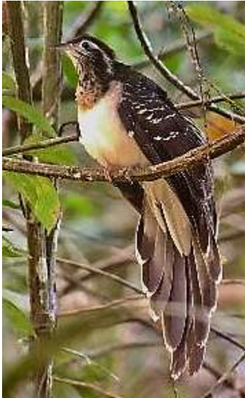
Pheasant Cuckoo © Jeri Langham