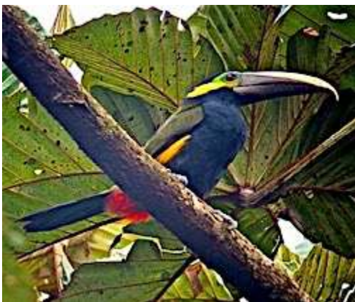
Yellow-eared Toucanet

We will focus again on the previously listed challenging species of this area, such as the Collared Trogon, and also visit the fruiting tree that has produced both Northern Emerald-Toucanet and the rarer Yellow-eared Toucanet. These elevations have the same potential as those we visited on our first trip to the far, undeveloped side of the gated community.