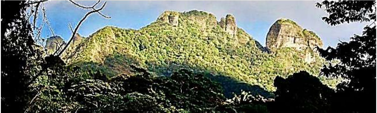
One of the volcanic ridgelines of Altos del Maria

We will focus again on the previously listed challenging species of this area, such as the Collared Trogon, and also visit the fruiting tree that has produced both Northern Emerald-Toucanet and the rarer Yellow-eared Toucanet. These elevations have the same potential as those we visited on our first trip to the far, undeveloped side of the gated community.