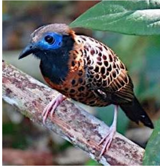
Ocellated Antbird