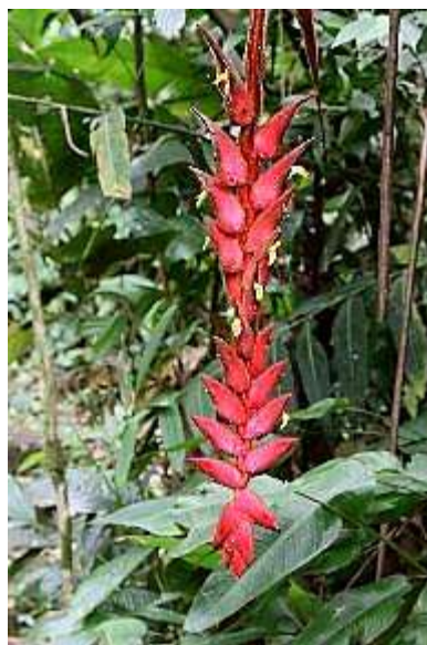
Heliconia rostrata