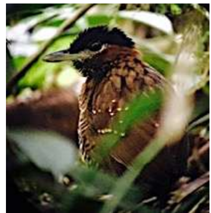
Black-crowned Antpitta

Many hours today are spent at Valle Bonito. The man-made small lake here has several covered kiosks and we always use one for our picnic lunch. Depending on fog we might come here before lunch since it is lower than the other areas we visit. There is a small stream feeding this lake and it has huge, epiphyte-covered trees on both slopes. A paved walkway follows the creek and, for the first ½ kilometer or so, is wide enough for wheelchair access. The trail meanders back and forth over the creek for about 1.5 kilometers. It is a paradise to walk, experience and bird. The greatest potential prize of this location is the stunning Black-crowned Antpitta. Though secretive and usually very difficult to see, we have a chance of finding one of these spectacular ground dwellers.