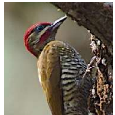
Stripe-cheeked Woodpecker