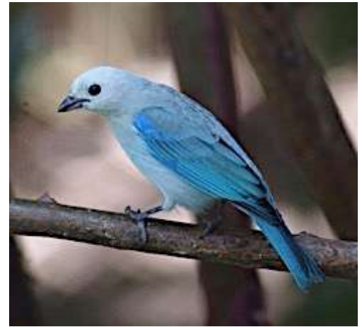
Blue-gray Tanager

Crimson-backed, Flame-rumped and White-lined tanagers; Black-striped Sparrow; Buff-throated Saltator; and Chestnut-headed Oropendola (a colony of which nests on the hillside above). Gorgeous Rufous Motmots are known to visit the feeders too.