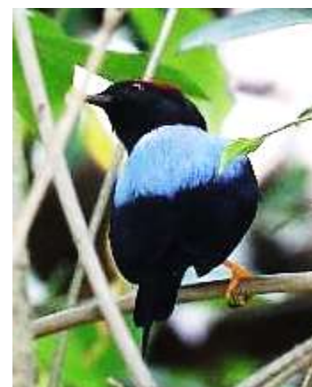
Lance-tailed Manakin