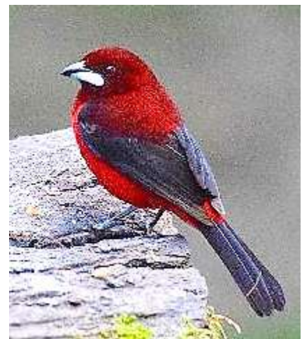
Crimson-backed Tanager

January 8, Day 5: Rainforest Discovery Center & Gamboa Area. This morning we will return to Pipeline Road, where we will spend the morning at the Rainforest Discovery Center (RDC). A highlight of our visit will be the time spent atop the RDC observation tower, which will give us an impressive view of the rainforest canopy. Blue Cotingas are regularly seen from here, as are Scaled Pigeon, various swifts, Squirrel Cuckoo, White-necked Puffbird, several species of trogons, Brown-capped Tyrannulet, Yellow-winged Flatbill, and