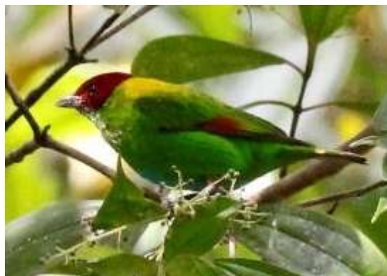
Rufous-winged Tanager