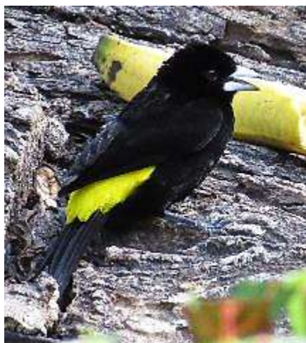
Flame-rumped Tanager